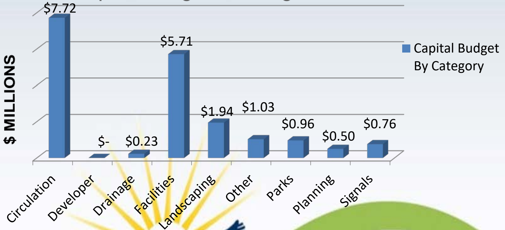
Capital Budget Funding Allocations