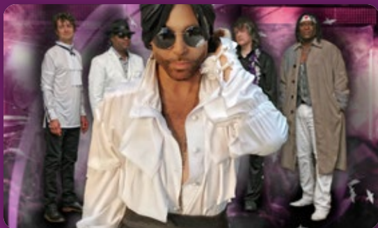
The Purple Xperience Sunday, February 27, 2022