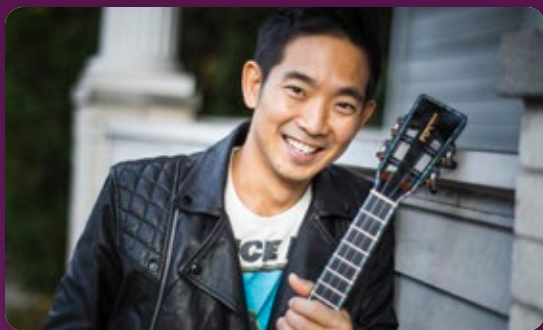
Jake Shimabukuro Saturday, November 6, 2021