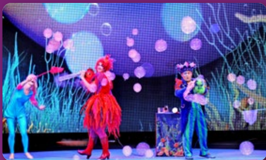
The Underwater Bubble Show Sunday, March 27, 2022